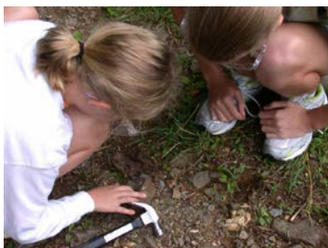
Rocks and Fossils

All camps are limited to 15 participants. The registration fee of $60.00 ($50.00 if paid before May 26 th ) includes a t-shirt and all camp materials. Partial camp scholarships may be available for those in need of assistance. Camps begin each day promptly at 8:30 am and last until 12:00 noon. Online registration is available on the Parks and Recreation website . For more information please contact the Nature Center at 423-989-5616 or the Department of Parks and Recreation at 423-764-4023, or you can email jstout@bristoltn.org .