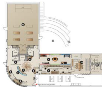
Upper Floor Topic Plan View Design Development