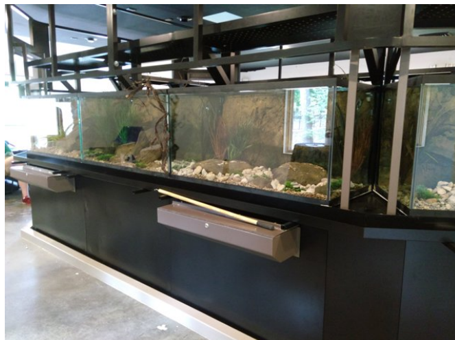
All new aquariums are now in place in one central array

From this point forward, things will be happening quickly as the pedestals and backdrops for the two large dioramas will be installed next. Once that work is done, the dioramas themselves can be constructed - one featuring the terrestrial creatures that call Steele Creek Park home, the other displaying the wide variety of birds that can be found in the Park.