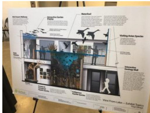
Graphic depiction of the Waterfowl exhibit

While all of these exhibits are being created and installed, the 1,200 square foot DeFriece-Wilson Classroom will be completed and fully equipped for use beginning in October when the building officially opens.