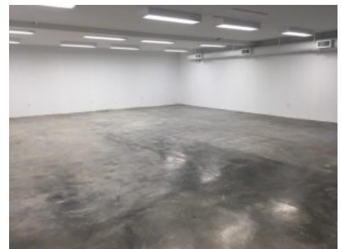
The future DeFriece-Wilson classroom

While all of these exhibits are being created and installed, the 1,200 square foot DeFriece-Wilson Classroom will be completed and fully equipped for use beginning in October when the building officially opens.