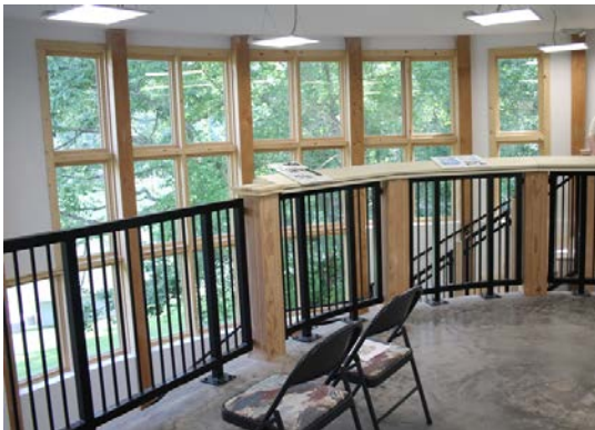
Balcony view overlooking the lake and knobs

One of the last exhibits to be installed before the opening in October is the waterfowl exhibit. An acrylic lake displaying taxidermy ducks and fish, with specimens of ducks and geese in flight overhead against a mural of billowing clouds, will mirror the view of the actual lake and knobs from the spectacular windows across the gallery.